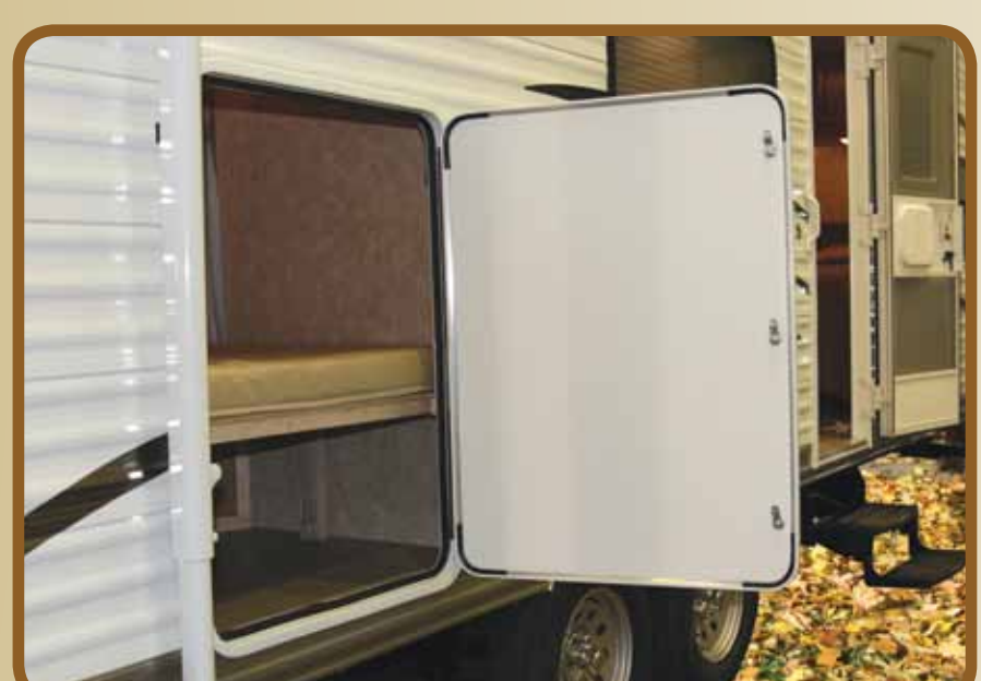
Easy Store Door Standard on 26BH, 28BHS, 30BHS and 32BHDS for quick door side access to stored items!!!