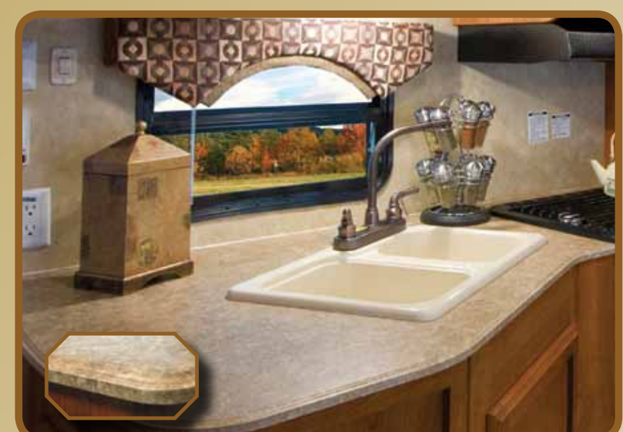
Thermal Foil Countertops NOT T-Mold Edge also a 60/40 Sink Basin with a High Rise Faucet