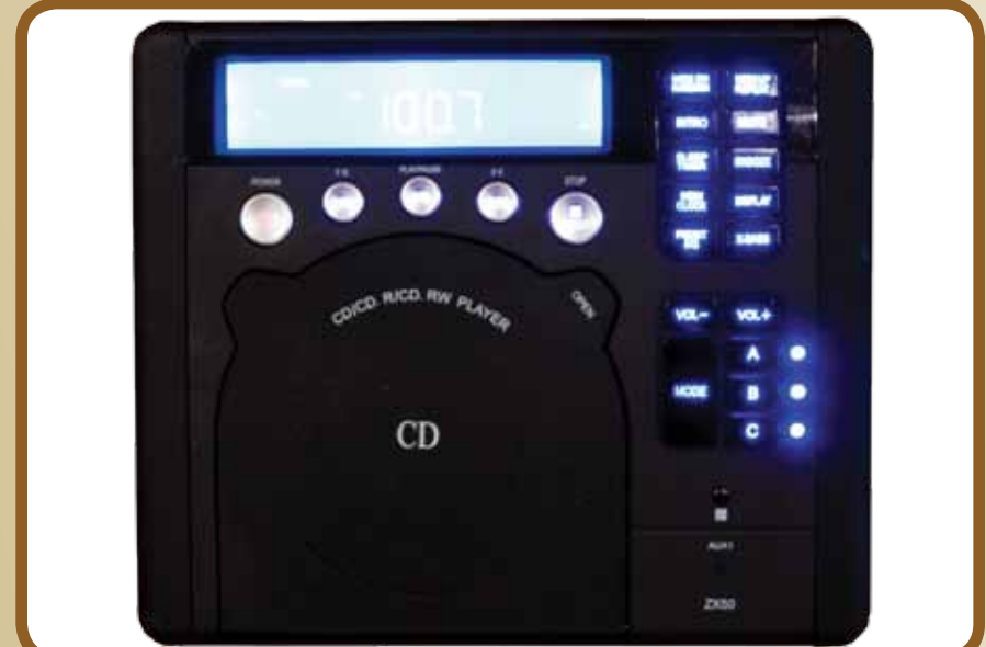
AM/FM CD Radio and Antenna with Speakers and IPOD Docking Port