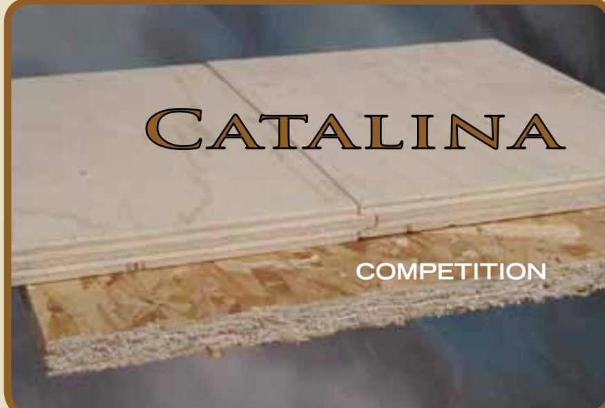
5/8" Tongue and Groove Flooring NOT OSB Flooring (MORE Strength)