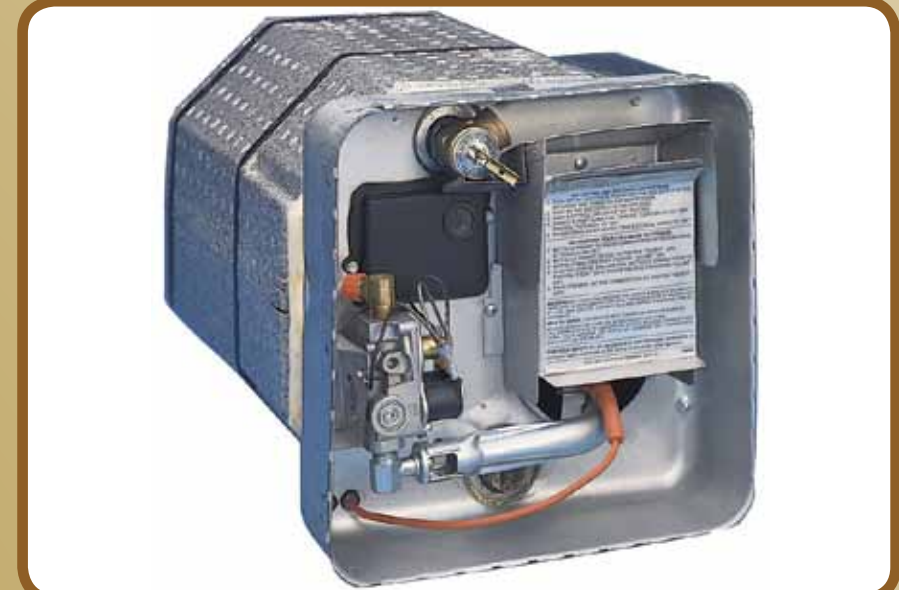
6 Gal. DSI Remote Operated Water Heater (Fire up your Water Heater from Inside your Catalina)