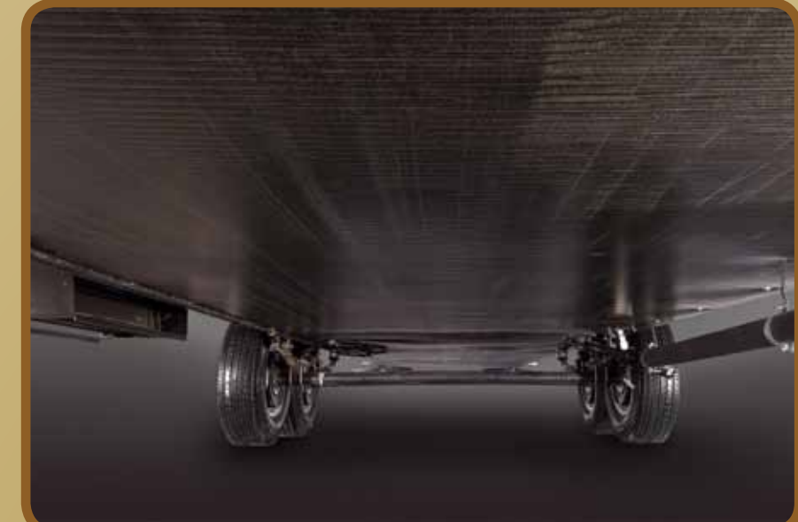
Heated and Enclosed Underbelly for Extended Camping and Minimal Wind Drag