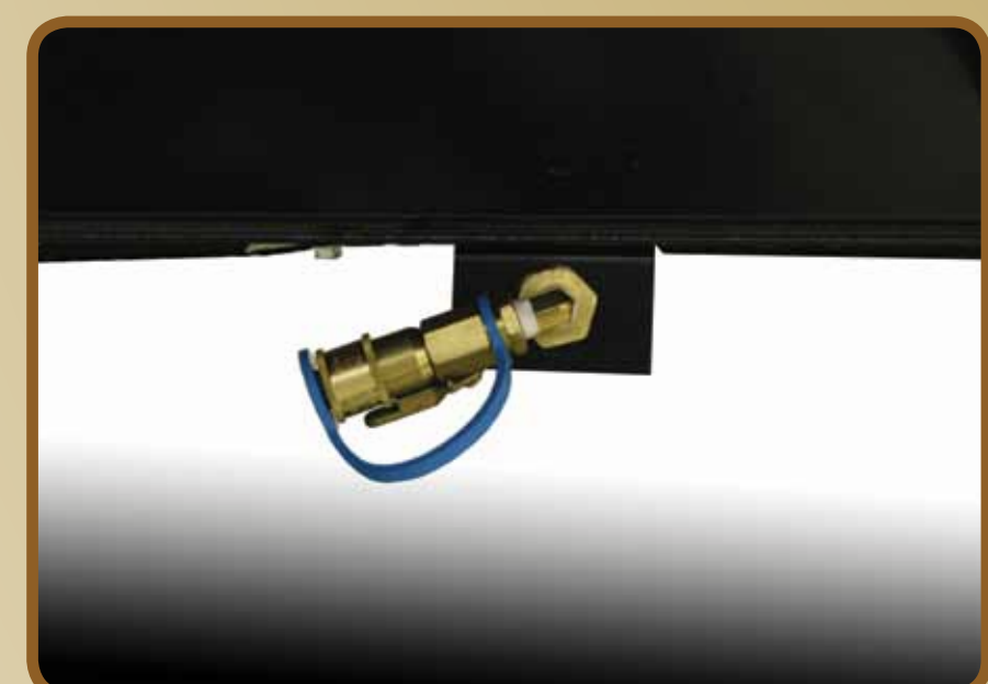
Exterior LP Quick-Connect Valve for adding a Outside Grill and other Propane Accessories to your Catalina