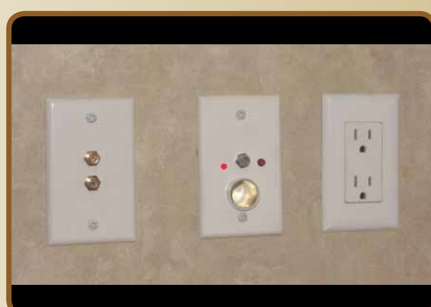
Interior Audio Hook-Up for TV to Speakers, Pre-Wired for Cable and TV Antenna Booster