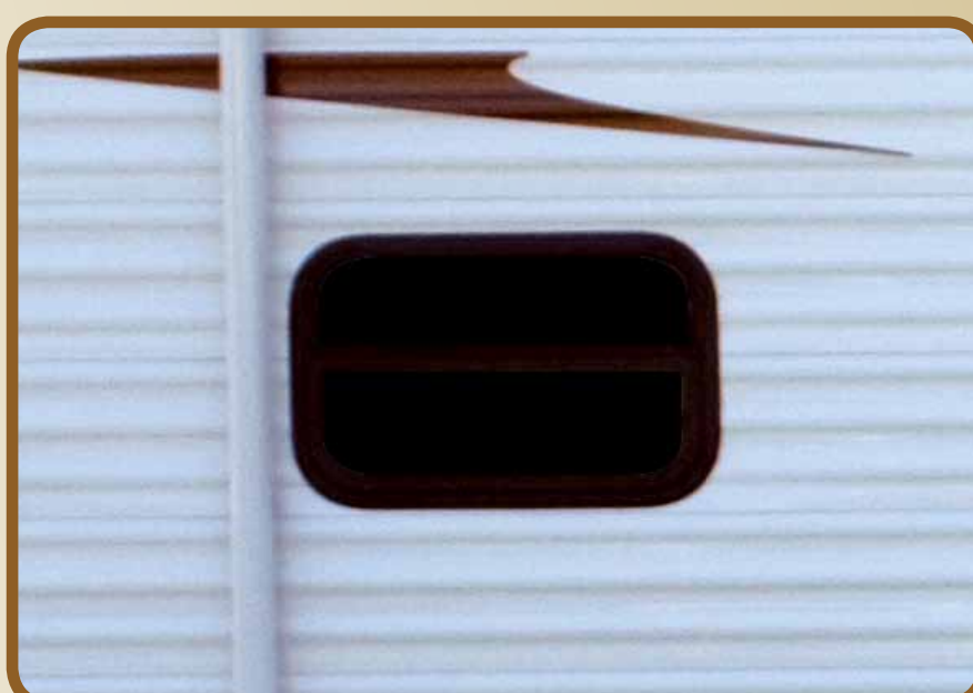
Black Frame Safety Glass Tinted Windows