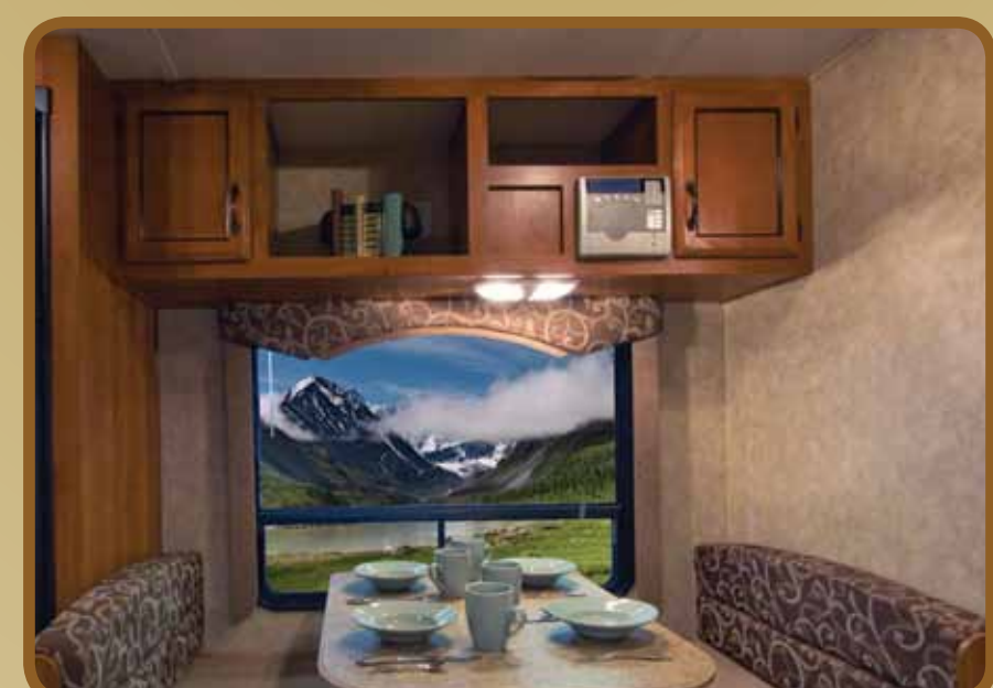
Oversized Dinette Window for a Great View (All Models) (2) Storage Doors at Dinette Base on All Models Except 20RD & 21BH