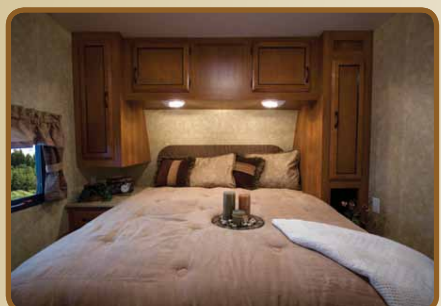
Deluxe Bedroom Décor with Comforter, Pillow Shams, and Headboard! Also comes with 2 Shirt Closets, a nightstand with Drawer, and Flip-Up Bed Storage Access!!