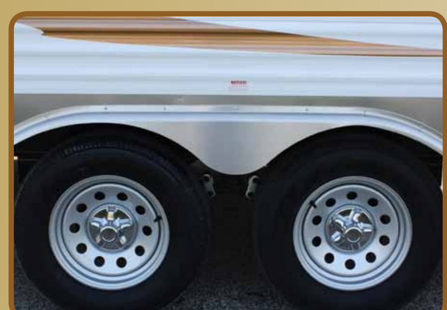
Polished Aluminum Fender Skirts and Radial Tires with E-Coat Wheels to minimize opportunities for Rust or Corrosion