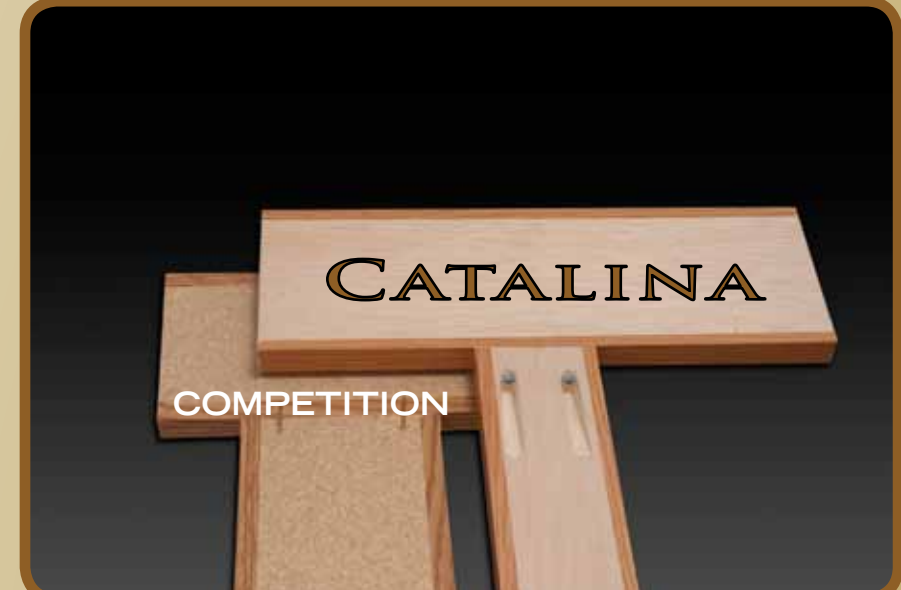
Screwed Cabinet Fascia NOT Stapled like most brands (MORE Strength)